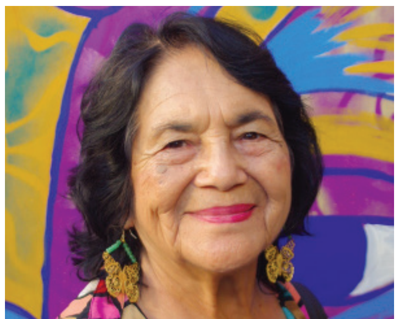
Dolores Huerta (1930-present) Co-founder of the United Farm Workers Association, Dolores Clara Fernandez Huerta is one of the most influential labor activists of the 20th century and a leader of the Chicano civil rights movement.