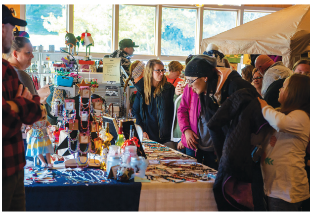
This year's Peek'n Peak Fall Festival will include over 100 arts and crafts vendors for you to enjoy. Some will be set up inside the ski lodge, and some will be outside on the surrounding grounds.

There are some events that will be happening each day of the Fall Festival. Entertainment will begin each morning with DJ Felix who will be playing music starting at 10am. You will also find strolling magicians, frisbee dog shows, carriage and pony rides, and pumpkin cannons throughout all of the days of the festival. The Kid's Zone will be open all day during the four-day festival. There will be interactive children's activities as well as face painting, balloon artists, train rides, kids' crafts and more. Peek'n Peak's thrilling Mountain Adventures will still be operating during the weekends of the Fall Festival. If you want to experience any of these thrill-seeking attractions, you can buy tickets at the Sugar Shack.