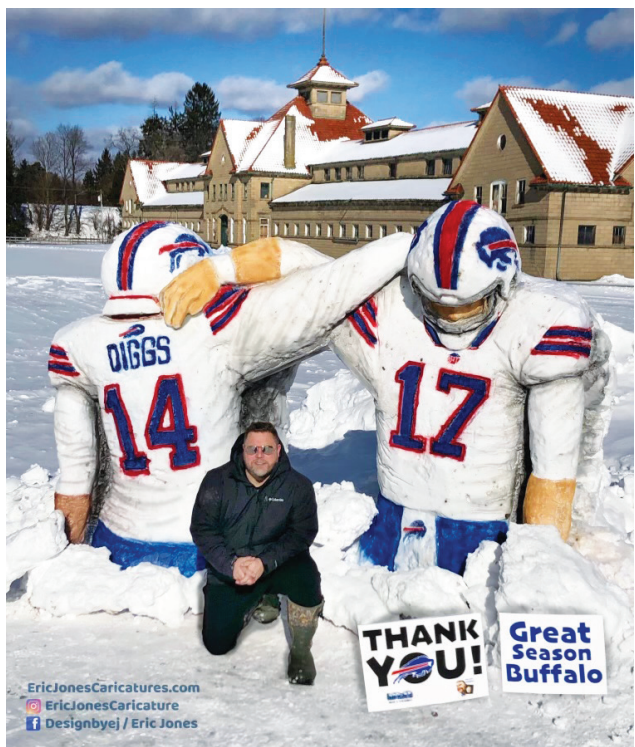
While exploring different mediums, he began creating snow sculptures and became well-known for his Buffalo Bills creations. His giant sculpture of Stefan Digs and Josh Allen went viral in 2022, and he has created many others since.